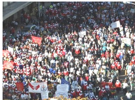
Delegate march and street rally in Durban.